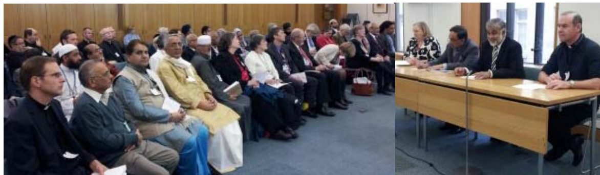
A view of the event at Attlee Suite, Portcullis House

To recognise the unique contribution Multi-Faith Chaplaincy makes to the care of the patients within the NHS the Multi-Faith Group for Healthcare Chaplaincy held a Reception on Thursday 24th December 2011 at the Attlee Suite, Portcullis House in the Palace of Westminster. Aptly titled as 'Celebrating Multi-Faith Chaplaincy in Healthcare, the event was held during the National Inter-Faith Week 2011.